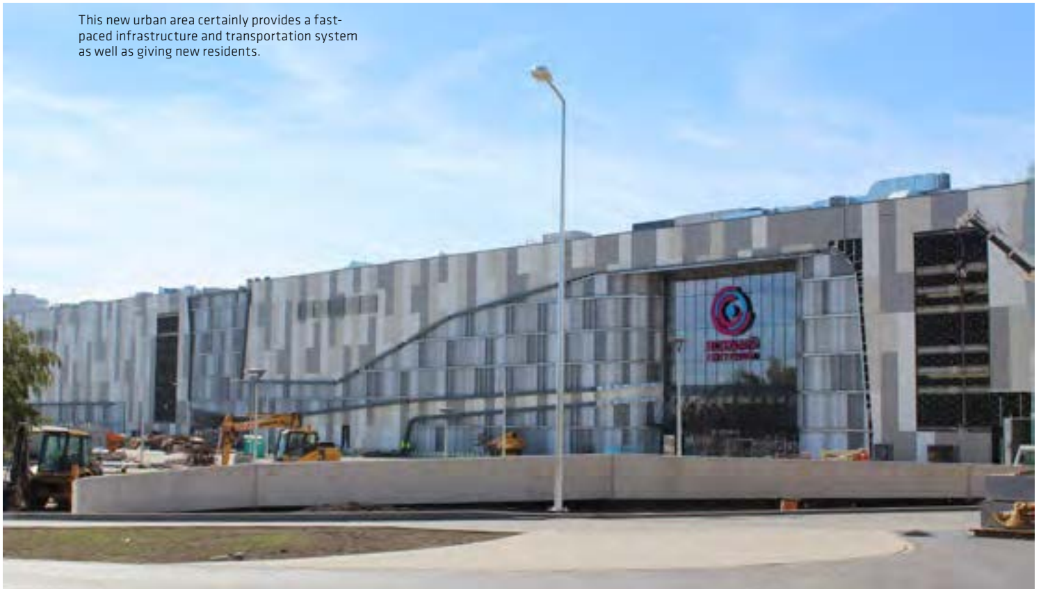
This new urban area certainly provides a fast-paced infrastructure and transportation system as well as giving new residents.